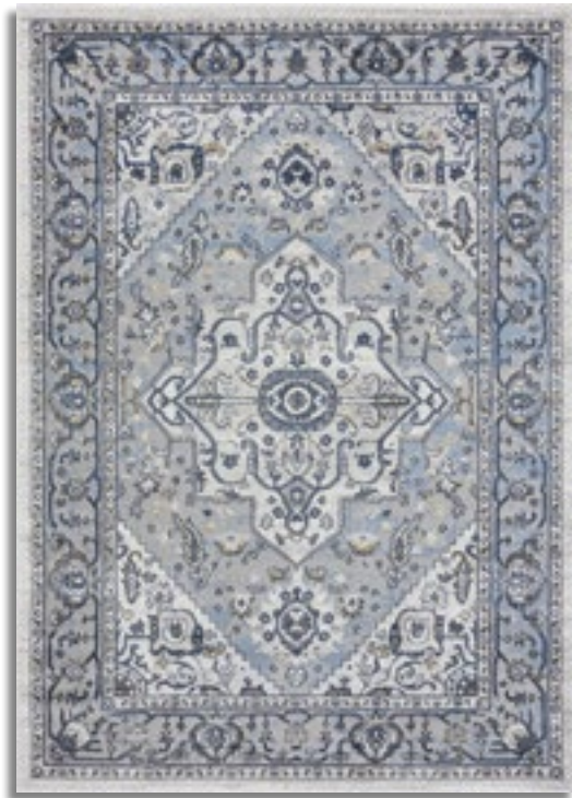
2610 20067/Blue Grey