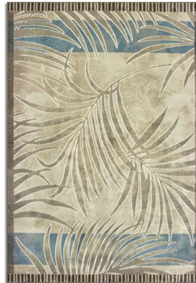
1821 40217/Palm - Natural