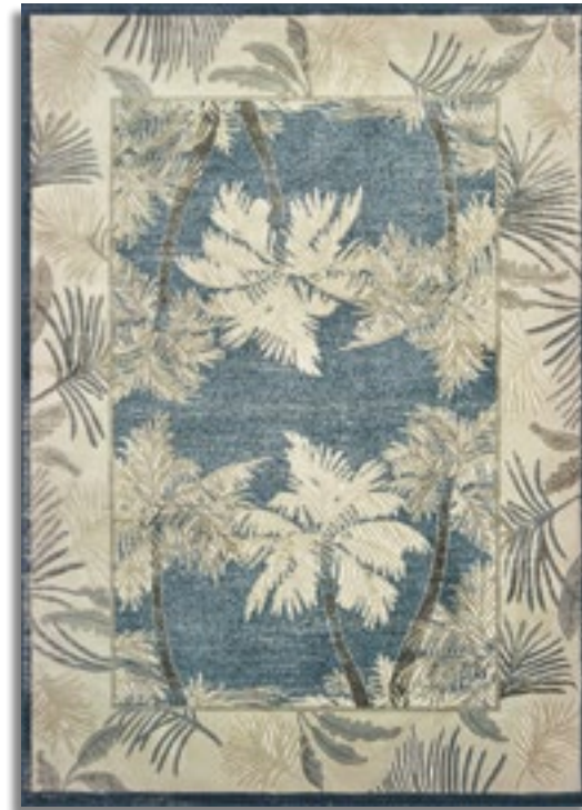
1821 40062/Lanai - Blueberry