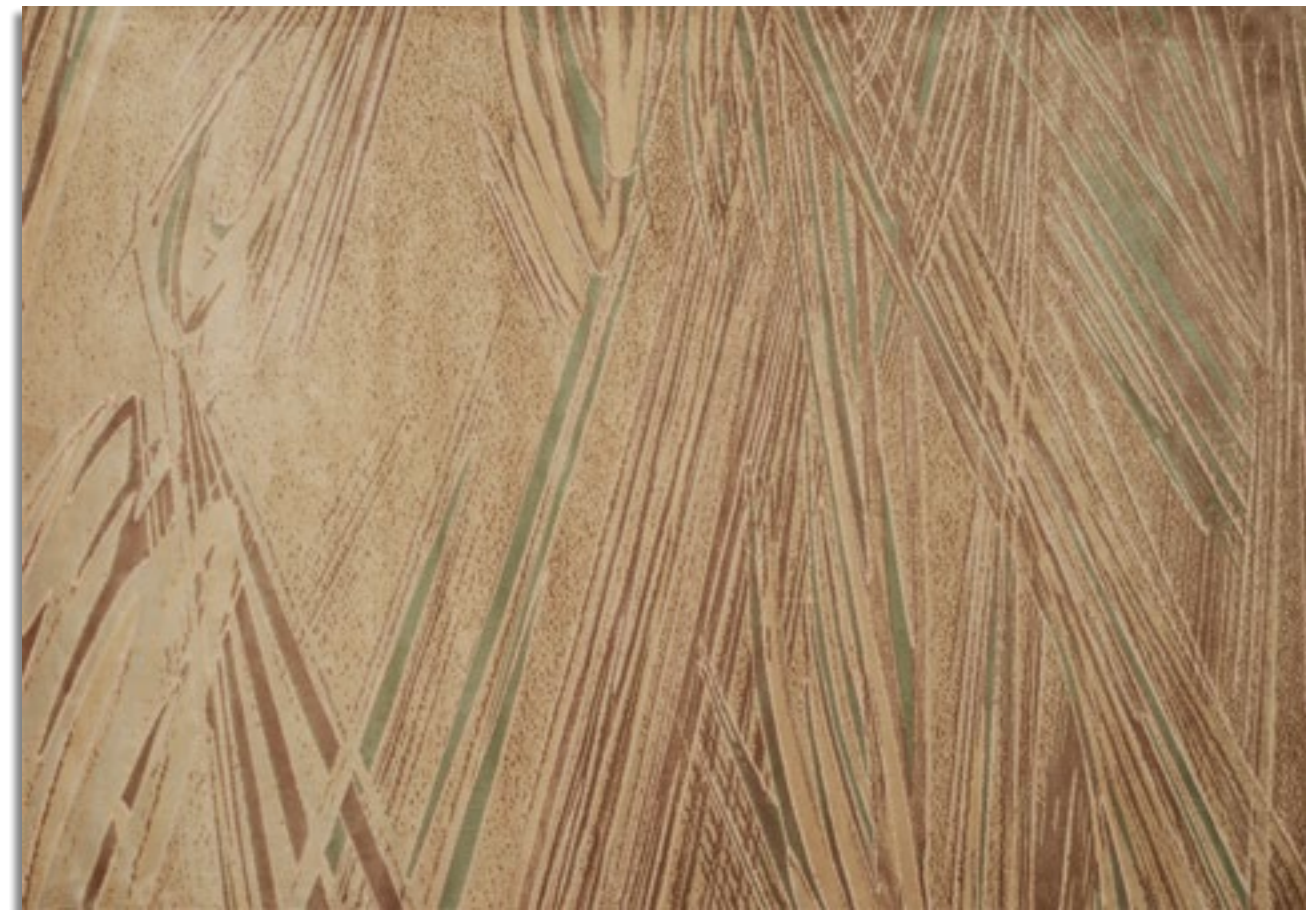
1821 40441/Alluvion - Seafoam

1'10" x 3' | 5'3" x 7'2" | 7'10" x 10'6" | 9'10" x 13'2" | 12'6" x 15'