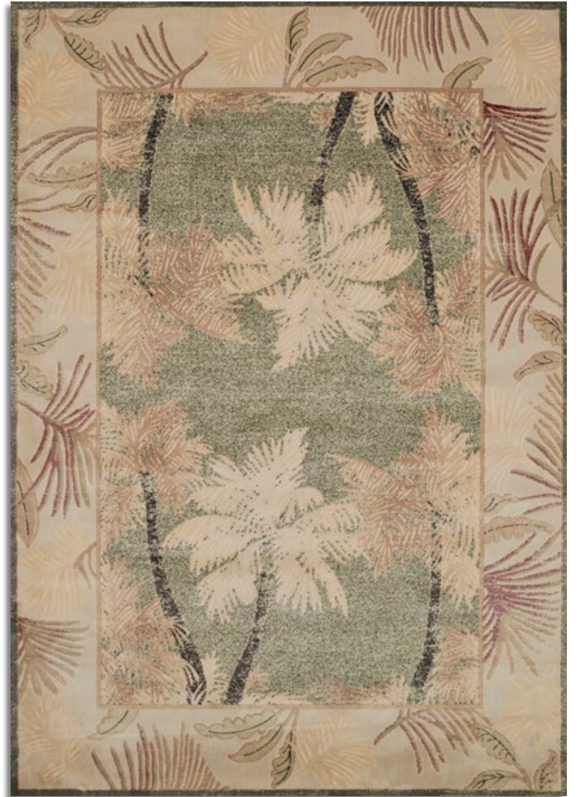
1821 40041/Lanai - Seafoam

1'10" x 3' | 5'3" x 7'2" | 7'10" x 10'6" | 9'10" x 13'2" | 12'6" x 15'