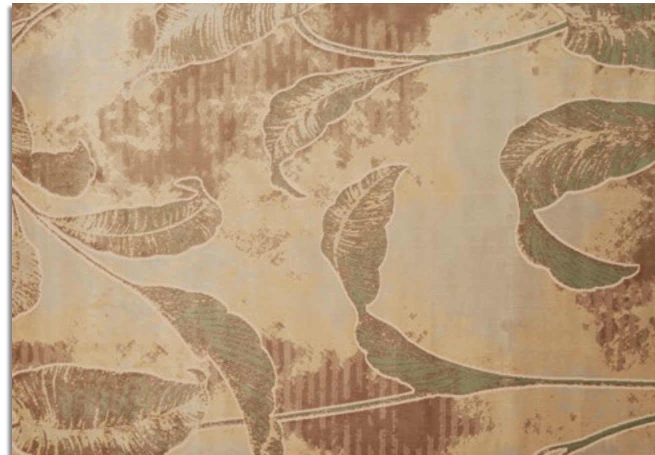
1821 40141/Big Sur - Seafoam

1'10" x 3' | 5'3" x 7'2" | 7'10" x 10'6" | 9'10" x 13'2" | 12'6" x 15'