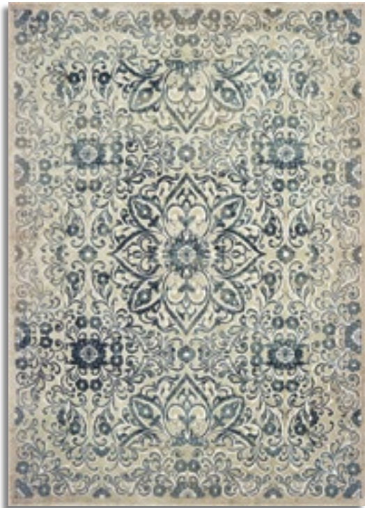
1821 40317/Sevilla - Natural