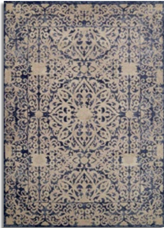
1821 40362/Sevilla - Blueberry