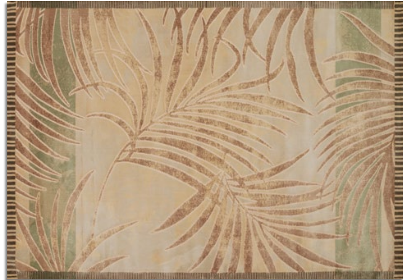
1821 40241/Palm - Seafoam

1'10" x 3' | 5'3" x 7'2" | 7'10" x 10'6" | 9'10" x 13'2" | 12'6" x 15'