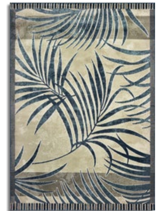
1821 40262/Palm - Blueberry

*Additions to Panama Jack Original Collection