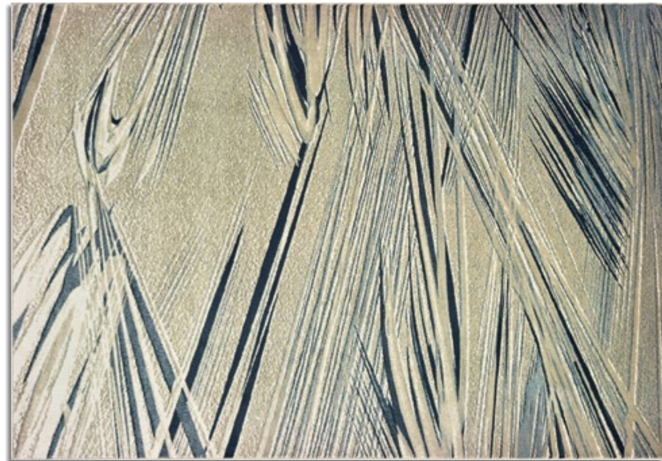
1821 40462/Alluvion - Blueberry