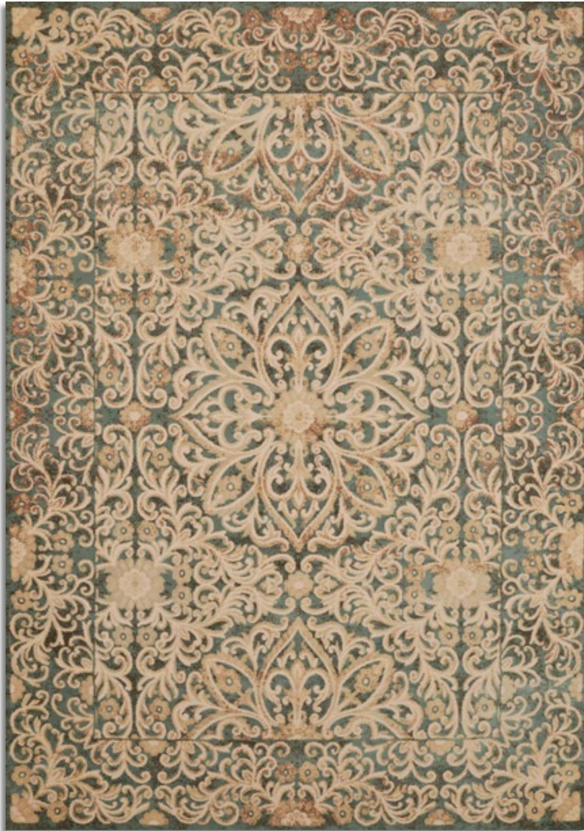
1821 40341/Sevilla - Seafoam