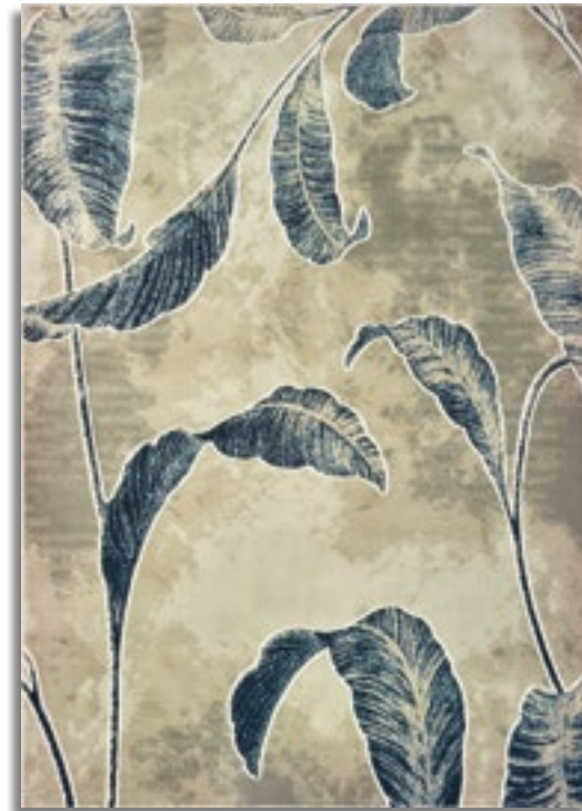
1821 40162/Big Sur - Blueberry