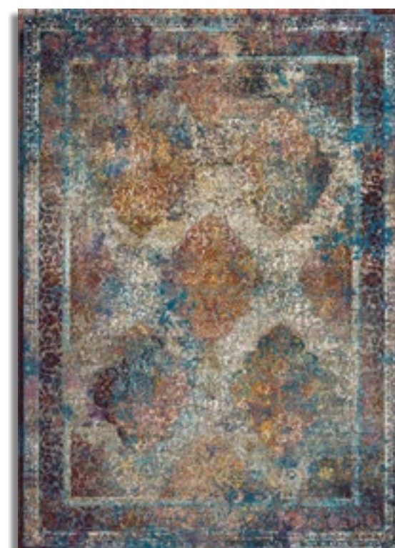
1831 30775/St. Croix - Multi