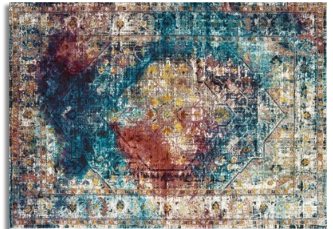
1831 30863/Antigua - Aqua