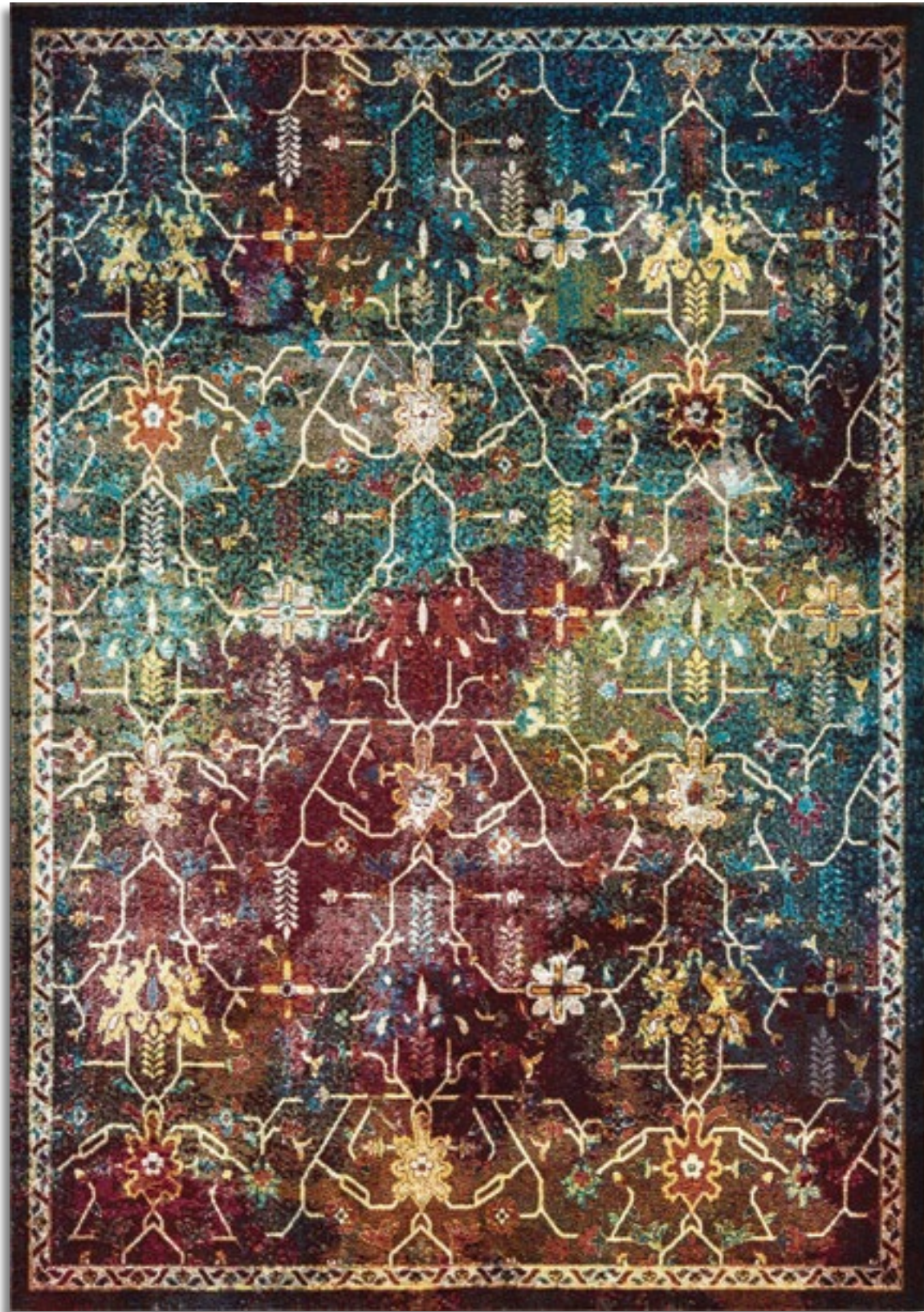
1831 30375/Montego - Multi