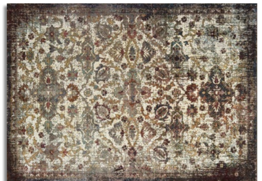
1831 30917/Jamaica - Natural

1'10" x 3' | 5'3" x 7'2" | 7'10" x 10'6"