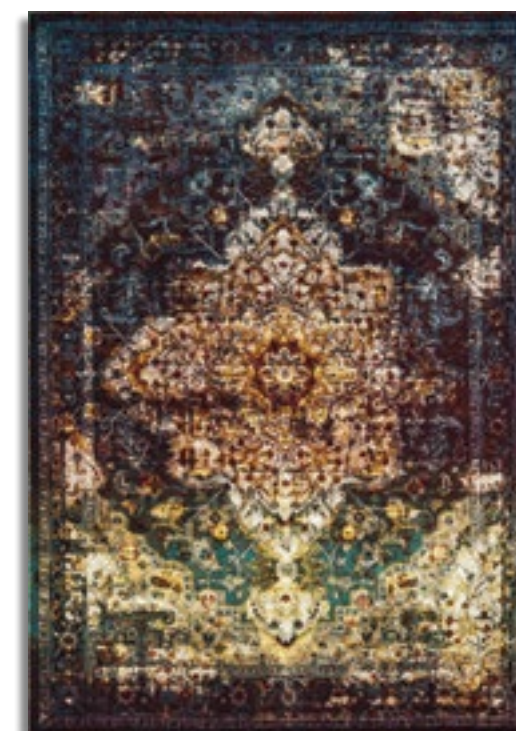
1831 30175/Bahama - Multi