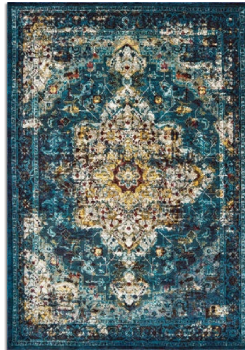
1831 30163/Bahama - Aqua