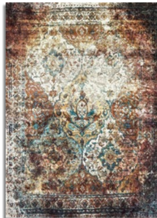
1831 30575/Martinique - Multi