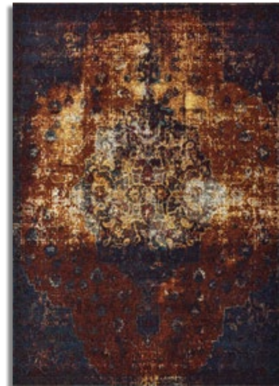
1831 30675/Barbados - Multi