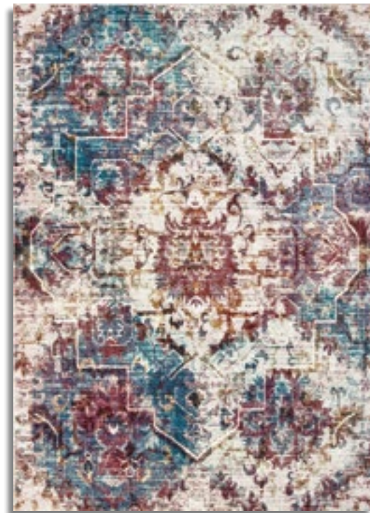
1831 30417/Cayman - Natural