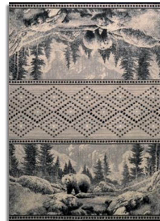
711 32571/Sedona Bear - Silver