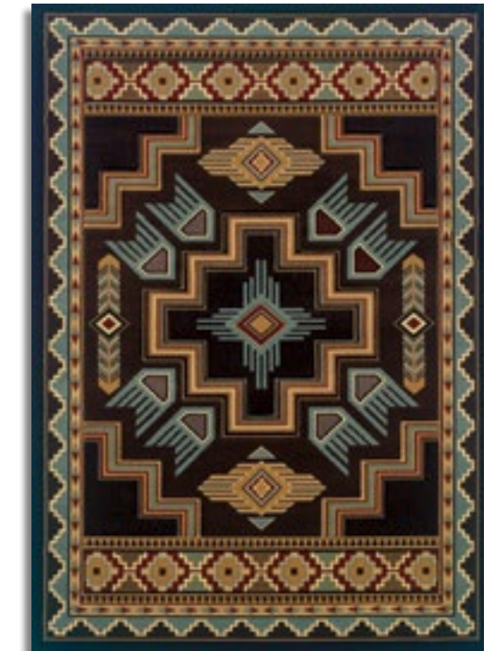
511 25366/Talon - Smoke Blue