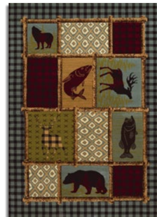
511 31775/Acadia Park - Multi