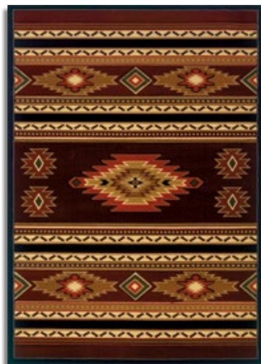
511 25929/Soaring Diamond - Terracotta