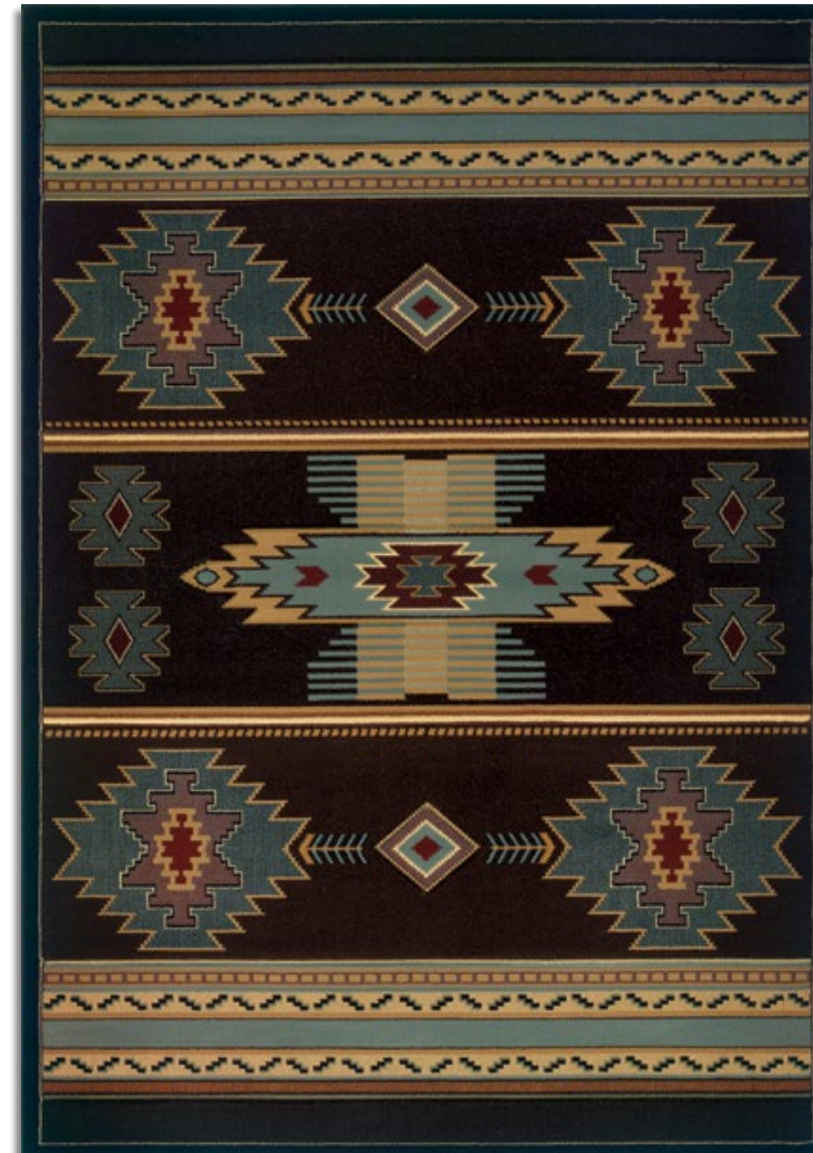
511 25266/Native Canvas - Smoke Blue

1'10" x 2'8" | 2'7" x 7'4" | 2'7" x 4'2" | 5'3" x 7'6" | 7'10" x 10'6"