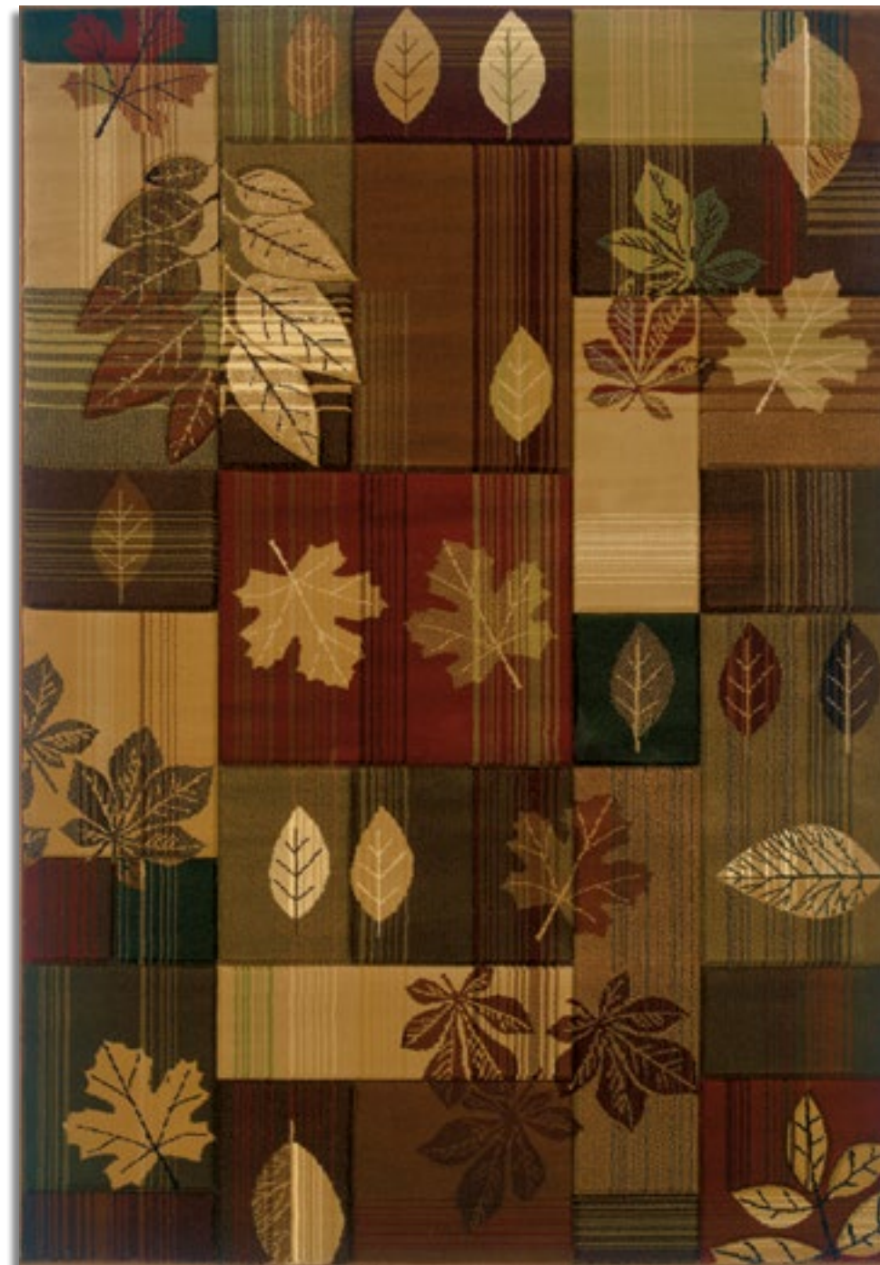
511 25159/Autumn Bliss - Toffee