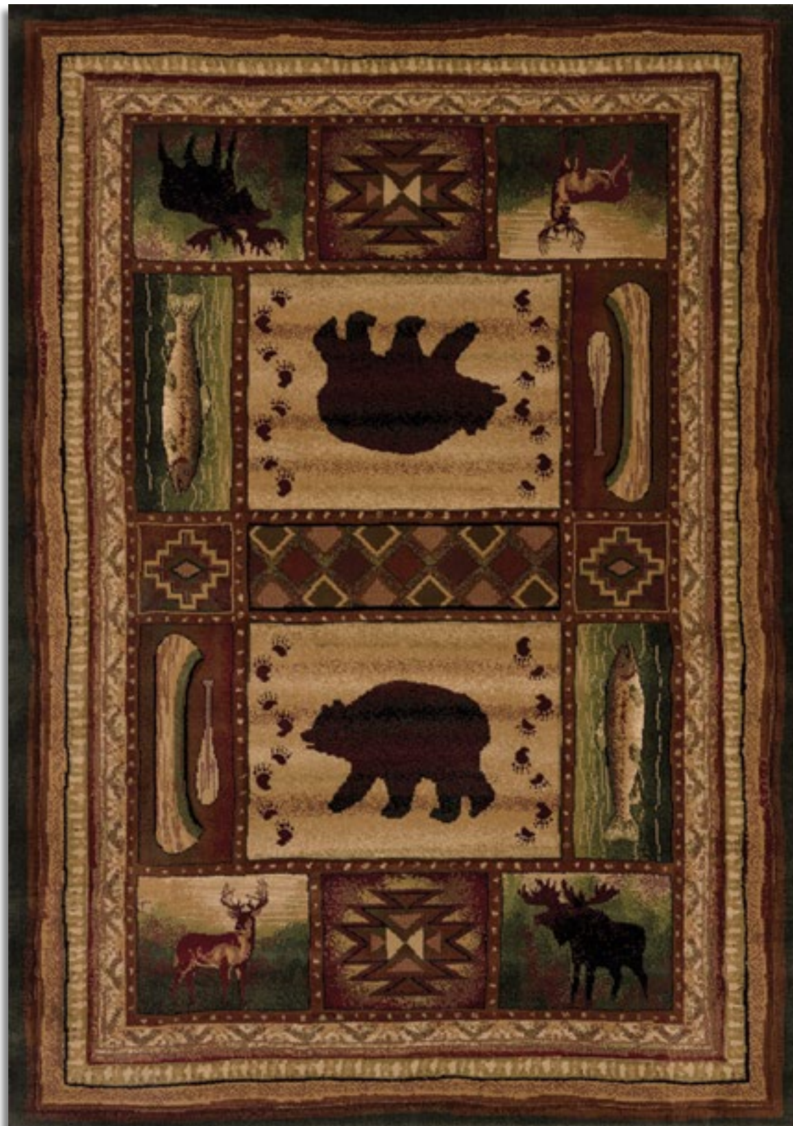
511 28059/Bear Wilderness - Toffee