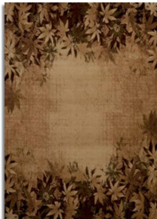
511 29859/Autumn Trace - Toffee